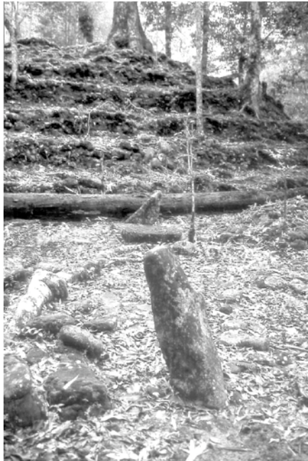
Plate 1 : The terraces at Lebak Sidedug, near the Baduy area.

The next terrace, called lemah bodas , which contains nothing, is said to be the place where the spirits of the deceased gather before being united with Batara Tunggal. The third contains the seats of the grandchildren of Batara Tunggal, the ancestors of the pu'un , (hamlet heads). The next nine terraces function variously as pilgrimage sites and places where notables